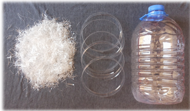
Figure 1: Preparing of PET from plastic bottles