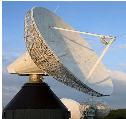
Figure-1: Transmission Antenna