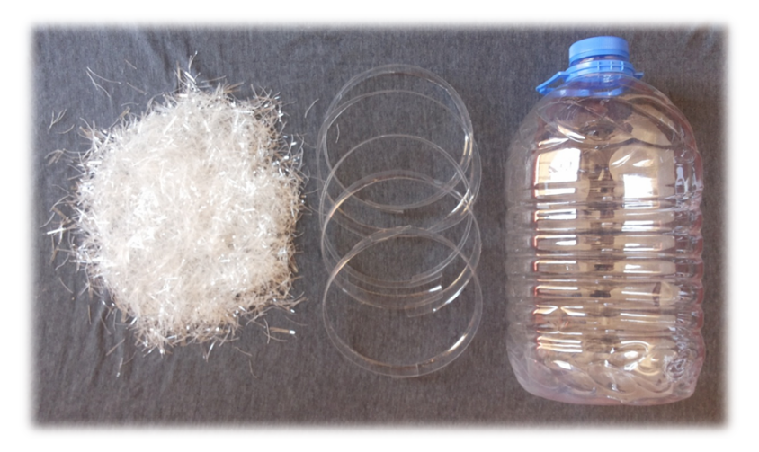
Figure 1: Preparing of PET from plastic bottles