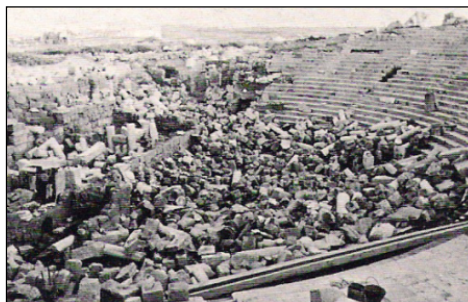
Figure 2: The part found from the theater during the excavation and exploration [5].

Note: (the most we can talk about in this regard, that there not monitoring ... these monuments for the area of Leptis and the ministry of reports or documents of the restoration operations that have been conducted on the monument whether old or modern and these is only one book in the scientific library in Italian Language detailing the exploration & restoration carried out from 1937 – 1951. As for the modern restoration it has no documents except for some photographs).