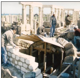
Figure 12: Using the limestone bricks to roof the western entrance of the theatre [10].

After restoration of the eastern entrance to the theater, there was a great controversy by the interested and specialists in the field of archeology to the extent of submitting complaints to UNESCO, but the process of restoration did not stop, and the restoration of the western entrance continued by using the limestone block and cement mortar as a bond and then poured concrete above it as a different treatment from was carried out on the eastern entrance, but these