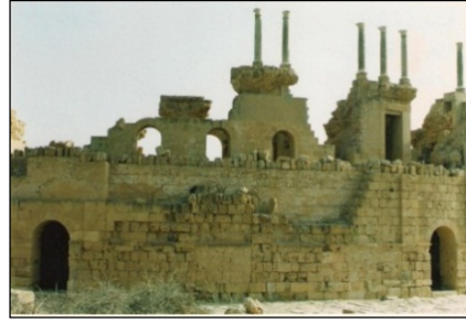
Figure 13: The outer wall of the theater before its restoration[10].

ted with colors compared to the stone color and then the crystallized salts appearing on the wall surfaces and the building turned into a monster that had nothing to do with the original form, (Figures 13,14,15 and 16).