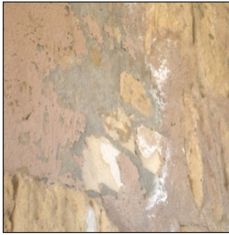
Figure 9: The use of black cement and paint it with a contemporary paint,(Authors,2012)