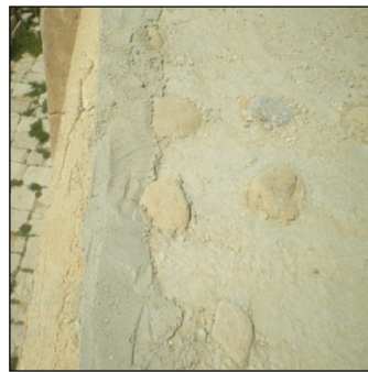
Figure 8: Using concrete in the floors and surfaces,(Authors,2012)