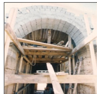
Figure 10: Using the cement block in the theater[10].

treatments were the implantation of cancerous tumor within the body of the building, even the attempt to replace it will lead to collapses and smash in the structure of the building, (Figure12), [10].