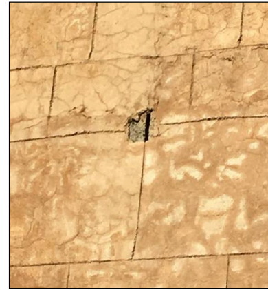
Figure 15: Using the cement blocks in the restoration of outer wall (Authors, 2018)