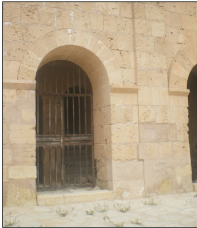
Figure 6: The current appearance of the arc with same old treatment, (Author-2018).

charter of 1972, which stipulates that "the repair should stop when the guesswork begins".