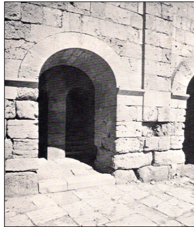
Figure 5: Treatment of arcs using materials of the same original building material [5].