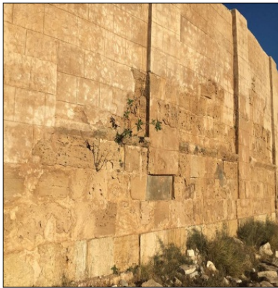
Figure 16: That produced by using cement material (Authors, 2018)

ted with colors compared to the stone color and then the crystallized salts appearing on the wall surfaces and the building turned into a monster that had nothing to do with the original form, (Figures 13,14,15 and 16).