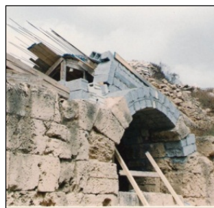
Figure 11: Using concrete and reinforcement steel in the roof of the eastern entrance of the theatre[10].