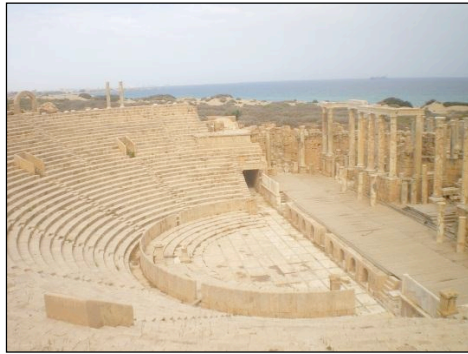
Figure1: general view of the Augusti theater(Authors,2018)

architectural configuration of the building in addition to being one of the largest buildings in the city of Leptis and performing its function until today.