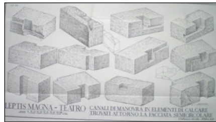
Figure 3: restoration of the building stores found in the excavations[5].

restoration process. This is because most of the building materials disappeared & were destroyed as a result of the damage factors and thefts that the city exposed to it during different ages (figure 2), which forced these who are responsible for restoration process to make the decision to using building materials from the residential and service buildings in the city. As for the materials found it has Lost large parts of its features and therefore the team specialized in restoration and maintenance of the stones has paid effort to repair them and trying to restore their original form to be returned to their place [2], (figure 3).