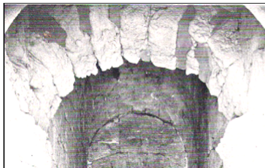
Figure 4: Effect of using cement mortar on building blocks[5].

Despite the preparation of preliminary studies and perception of the architectural form of the theatre, it was not delivered from some of the violations to the restoration although a few in total and do not violate international conventions. The use of cement was warned only in the Venice convention in 1964. We note the use of cement mortars in the rear entrances and their negative effect on the finishing layers and building stones. The chemical reactions that occur in the cement mix change the colors of the building materials and the finish formed over time as well as the erosion of the stones and the deterioration of the stones, (Figures 4).