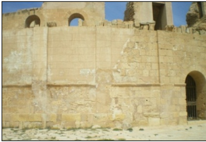
Figure 14: The outer wall of the theater after its restoration (Authors, 2012)